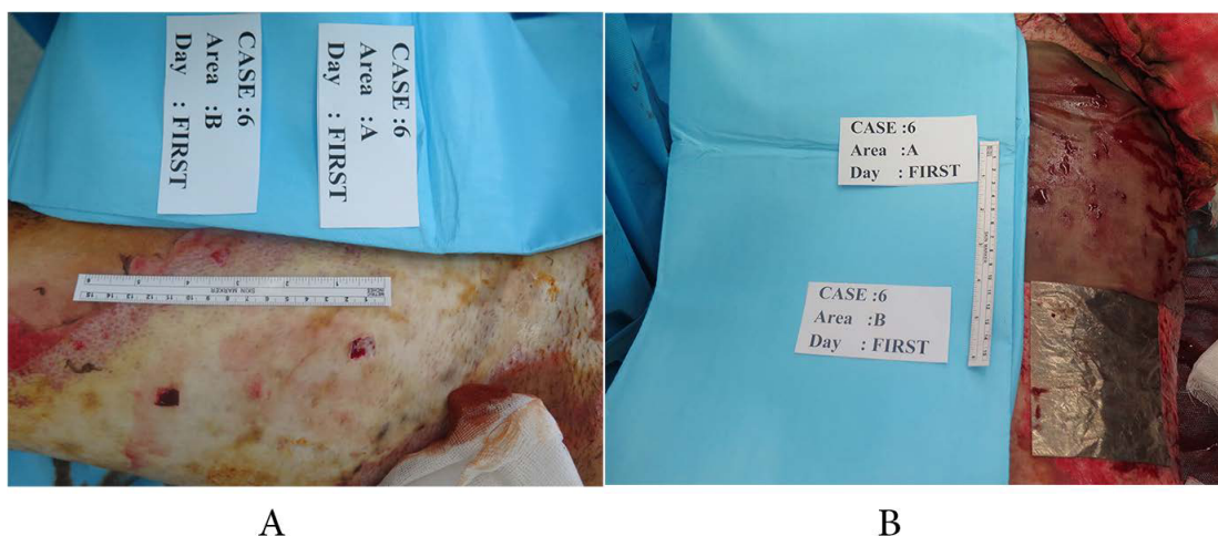
Fig. 1. A case of full thickness burn wound which is divided in two parts randomly

The frequency distribution of burn cause is shown by age and gender in Table 2. According to the results, fire, with the frequency of 9 of 18 (50%) was the most common cause of burns in men and flame and boiling water, with the frequency of 4 for each, were (33,3%) the most common among women. According to exact Fisher test, there was no significant